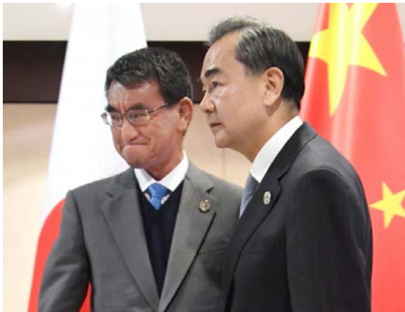
3Kono Tarō and Wang Yi meet in the Philippines ( Aug. 7, 2017)

In August, Chinese Foreign Minister Wang Yi met newly-appointed counterpart Kono Tarō on the sidelines of the ASEAN Regional Forum (ARF) held in the Philippines. In 1993, Kono's father, Kono Yohei, who also served as foreign minister, had as chief Cabinet secretary issued a statement acknowledging the involvement of the World War II Japanese military in forcing women to provide sex to soldiers, the so-called comfort woman issue.